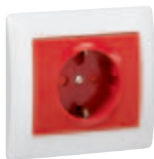
7759 30 White finish