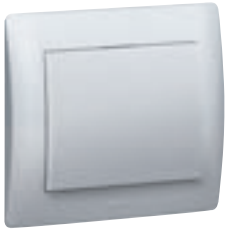
7758 06 Aluminium finish