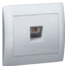
7759 38 Aluminium finish