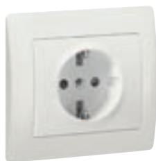
7759 21 Pearl finish