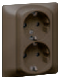
7712 31 Dark Bronze finish