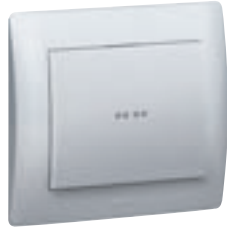
7758 20 Aluminium finish