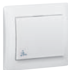
7758 52 White finish