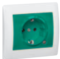
7710 44 White finish