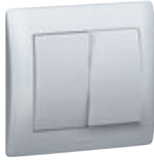
7758 05 Aluminium finish

Selection charts: cover plates (p. 546 to 551), plates (p. 552-553)