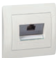
7758 28 Pearl finish