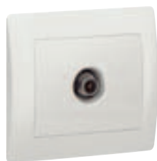
7759 65 Pearl finish