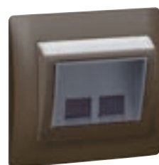
7758 41 Dark Bronze finish

Selection charts: cover plates (p. 546 to 551), frames (p. 552-553)