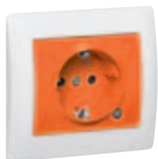
7710 45 White finish