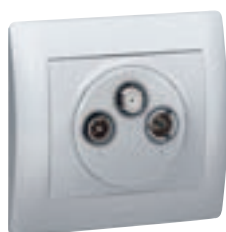
7757 89 Aluminium finish