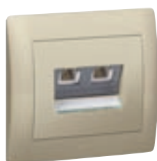
7759 39 Titanium finish