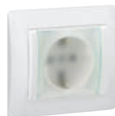
7759 24 White finish

Selection charts: cover plates (p. 546 to 551), frames (p. 552-553)