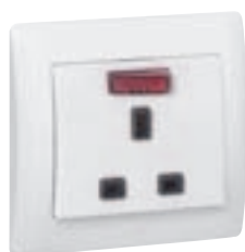
7758 48 White finish