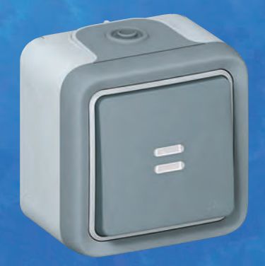
Time switch for all loads Cat.No 695 04 (p. 07)