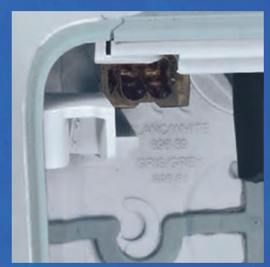
All the modular boxes are equipped with an automatic Nylbloc connector when a tap-off is required