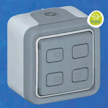
4-button scenario switch Cat.No 695 06 (p. 07)