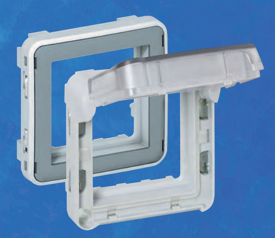
Plexo adaptors for Mosaic, with or without flap

Plexo has many new improved or ingenious features to aid installation. Like, for example, the four 1/4 turn fastenings, the visible fixing points, etc.