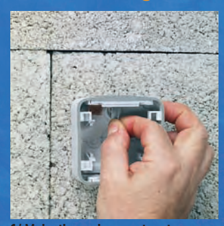
1/ Make the end cap cut-out by pulling the seal