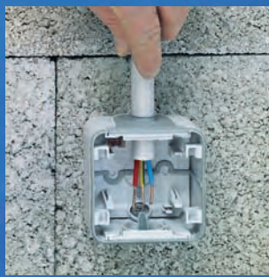
3/ The membrane of the end cap compensates for any misalignment of the tube and ensures IP 55 protection of the installation