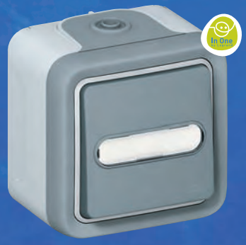
RF push-button Cat.No 695 05 (p. 07)