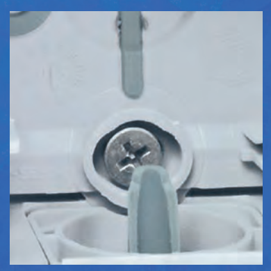
Visible and accessible fixing points; identical to the Plexo 55