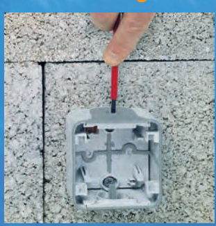
1/ Pierce the end cap using a screwdriver