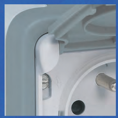
Locking by means of four 1/4 turn fastenings