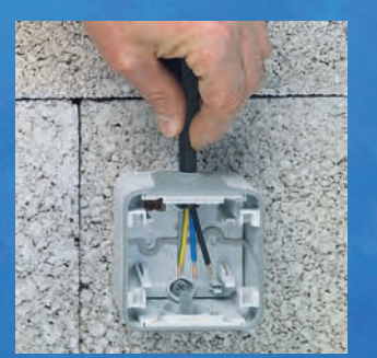
3/ The membrane of the end cap ensures IP 55 protection of the installation