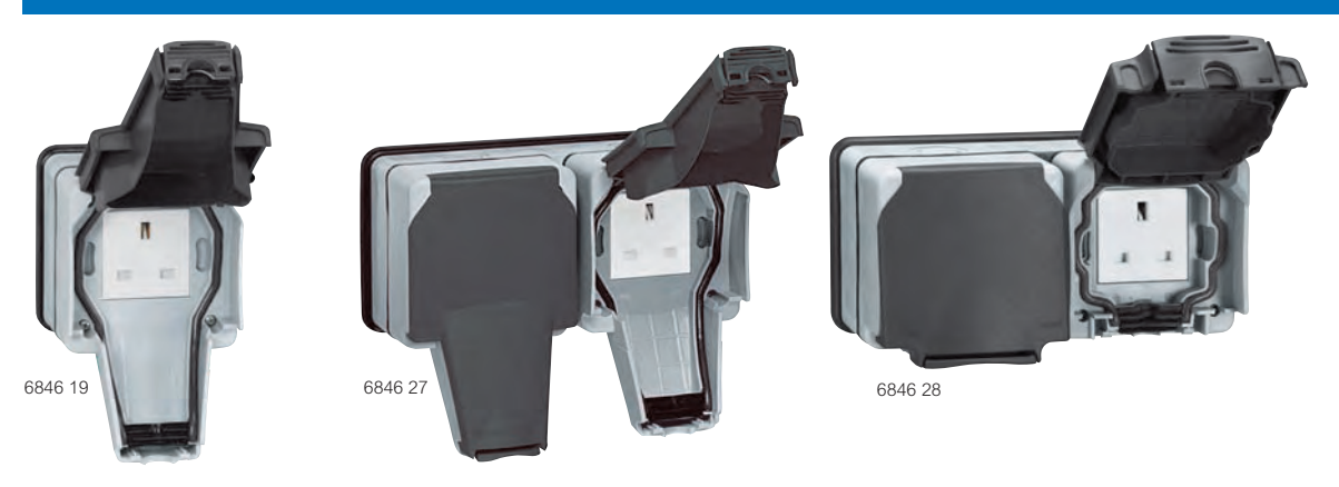
2 finishes: - Grey RAL 7016/TO 29.- White RAL 9010 Supplied with ISO 20 membrane glands and caps (for rear cabling). Stainless steel captive terminal screws supplied in backed-off position Supplied without lamps