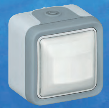
2-wire automatic switch without override Cat.No 695 00 (p. 08)

Many new functions are being added to Plexo range to satisfy all configurations, whatever your site. In addition, all control mechanisms with an indicator light or tell-tale are supplied with their bulb for insertion. Simple and practical!