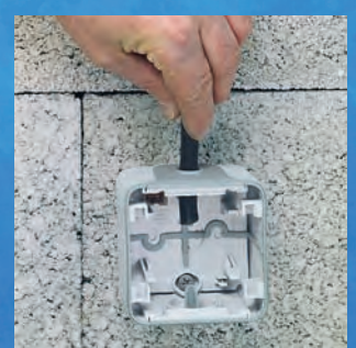
2/ Insert the cable through the end cap