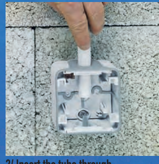
2/ Insert the tube through the end cap