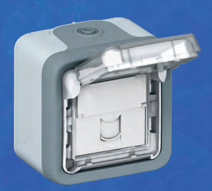
FTP cat. 6 VDI socket Cat.No 695 60 (p. 09)