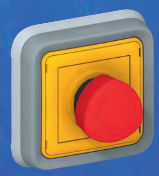
Push button with 1/4 turn unlocking Cat.No 695 49 (p. 09)